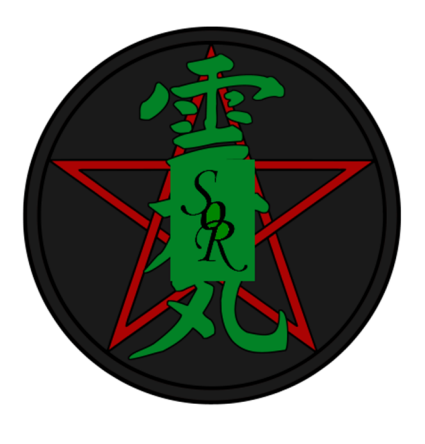
School of Reiki

The School of Reiki now has available places for new students to train in the art of Reiki FREE OF CHARGE at the online School - <u>School of Reiki Class Site</u> – you can sign up and start your training today and become a reiki Master! For more information visit the school website - <u>School of Reiki</u> – or email admin@schoolofreiki.org