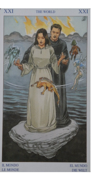
These cards are drawn from the Pagan Tarot Deck

If any of you would like to write in with your interpretations or even have them published in the next edition of the Correllian Herald, or wish to have a spread with your own deck featured then please send them to – <a href="mailto:heraldeditor@gmail.com">heraldeditor@gmail.com</a>