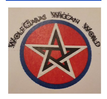
By Lady WolfCiara