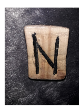
H - Hagalaz - Heimdall's Rune - rainbow Rune - RHAPSODY

Unpredictability, pointing to a need to understand the exact limitations; situations outside one's own control; try new things; structuring and balancing dimension; rainbow Rune, representing a heavenly light generating power.