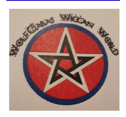
By Lady WolfCiara