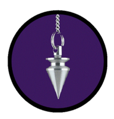
The Order of Divination Tarot Word Search