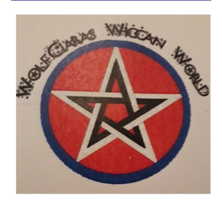
By Lady WolfCiara