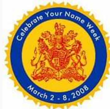
Celebrate Your Name Week 2008 logo

Please help introduce links in articles on related topics. ( January 2008 )