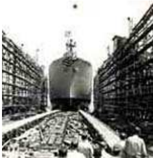
The S.S. Juliette Low, launched May 12, 1944. Pictured here in the Southeastern Ship Yards, Savannah, Georgia.

Although the couple moved to England, Juliette continued her travels and divided her time between the British Isles and America.