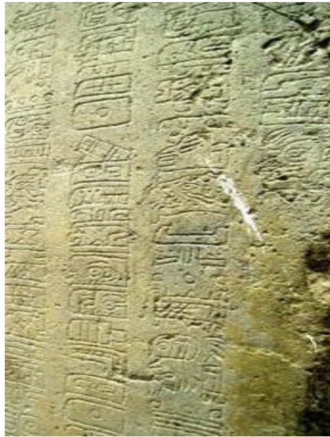
Inscriptions on the La Mojarra Stela

Hunab Ku (Sanat Hunabku Kumara) plans to spend a significant amount of time in Mesoamerica and the Yucatan, acting as benefactor and mentor to the Maya. Sanat Hunabku Kumara will make sure that the Maya have the necessary sacred tools and knowledge necessary for them to safely make the phase transition into the Fourth World, as the planet makes a quantum leap into higher states of Consciousness more readily available in the Age of Aquarius.