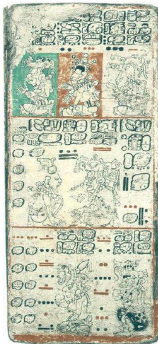
Mayan Culture Dresden Codex Page Nine

The knowledge they obtained from other teachings, myths, and symbologies enabled them to conceptualize higher truths and served as bridging tools for them between dimensional realities. For example, the tree was represented by the sacred symbol T which depicted the interrelationship between the living beingness of a tree and of the Maya priests and priestesses who consciously communed with it.