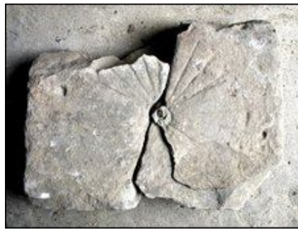
The dials were carved into the walls of some churches and monastic buildings

Historians believe the Augustinian canons lived according to a strict routine, which made it essential everyone in the community did the right thing at the right time.