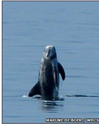
Popping up in Cornwall?