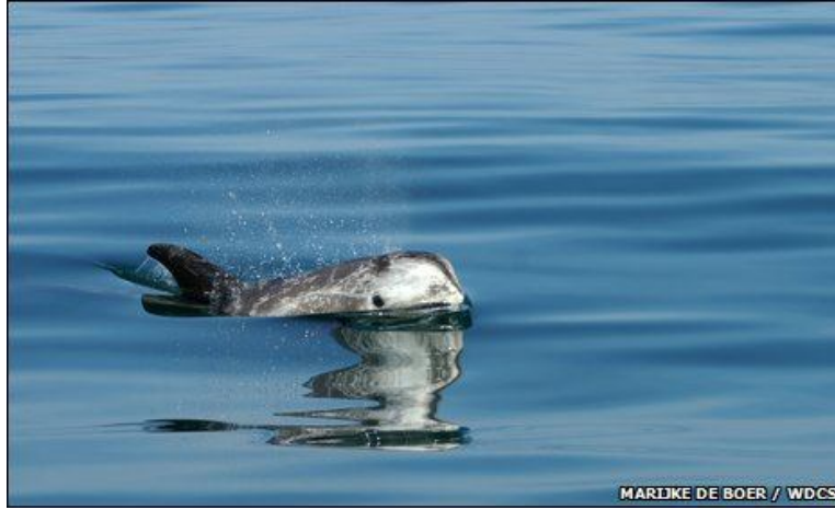
The Risso's dolphin photographed making a new appearance

An elusive dolphin has been sighted off Cornwall three years after being seen much further north in the Irish Sea. The rarely seen Risso's dolphin was photographed off Mounts Bay in Cornwall in June of this year. Scientists have now identified it as the same dolphin once seen 172 nautical miles away off Bardsey Island in Wales.