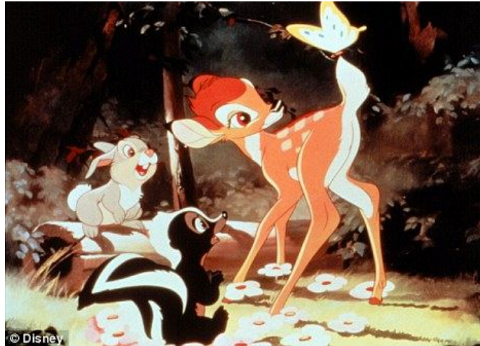
The tragic tale bears more than a passing resemblance to Disney's 1942 film Bambi, after which the doe was named