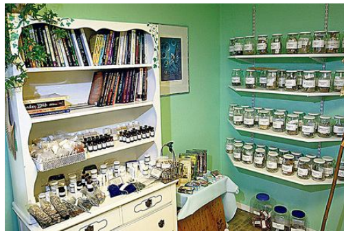
Inside FireStorms is a selection of "gifts for the mind, body and spirit."

They point out that Wicca is in many ways similar to many of the world's religions.