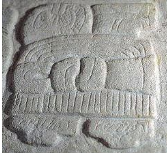
Maya Tikal Emblem Stela Glyph

This was the timeframe when the Maya mysteriously abandoned all the cities. It also corresponds to the Third World that Hunab Ku created for the Maya where they could live by themselves. It was meant to be the final or last world that the Maya would inhabit before the coming of the Fourth Flood and the return of god Hunab Ku to help create the Fourth World.